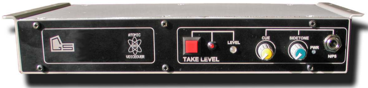
Voiceover 08 Voiceover artists interface